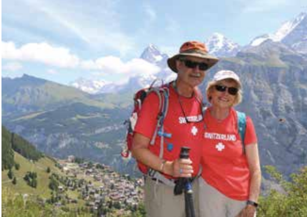
A group of hikers who meet at Cuesta Park in Mountain View joined an ECHO Rails &amp; Trails tour in Switzerland.